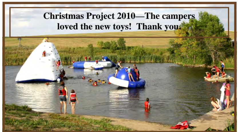
Christmas Project 2010—The campers loved the new toys! Thank you.