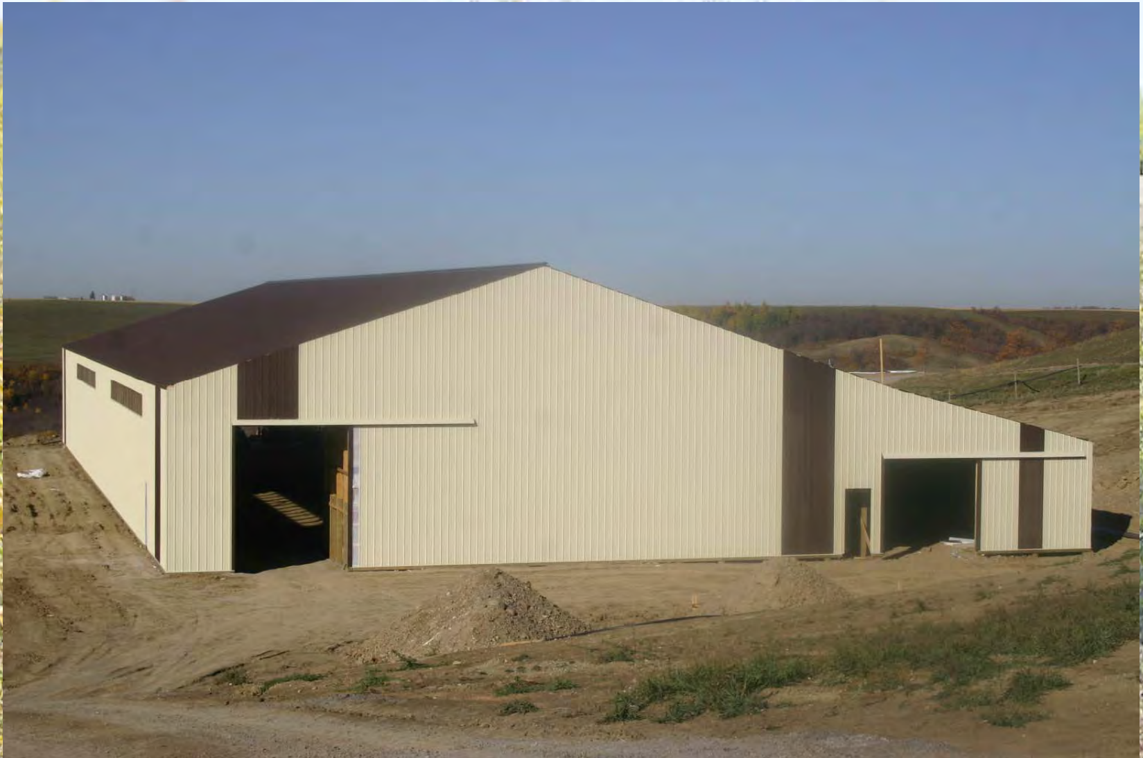
Indoor Riding Arena