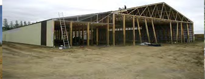
Indoor Riding Arena